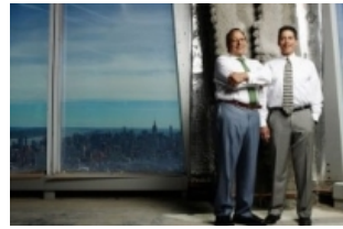
For Dursts, World Trade Center Deal Is A Pinnacle

FORBES' ranking of the richest families, pinning down 185 billion-dollar dynasties collectively worth $1.2 trillion.