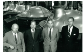
How To Blow $9 Billion: The Fallen Stroh Family